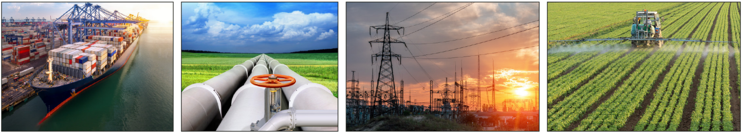
Figure 1: Examples of Critical Infrastructure

GAO-22-104256